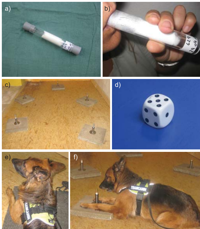
FIGURE 2. Applied methods for breath sampling and testing. a) Glass tube used for breath sampling. The lumen is filled with the polypropylene fleece. b) For breath sampling, study participants exhaled five times through the collection device. c) Test set-up showing the probe retainers. d) The position of the lung cancer samples was randomised. e) Sniffer dogs were trained to identify lung cancer in the breath sample of patients. f) The dogs were trained to indicate a positive test tube by lying on the floor in front of the tube with the muzzle touching the test tube.

no significant statistical difference regarding their constitution. As a consequence of the training strategy (applying breath samples of groups A and B, but not C), the sample age of group C was significantly less.